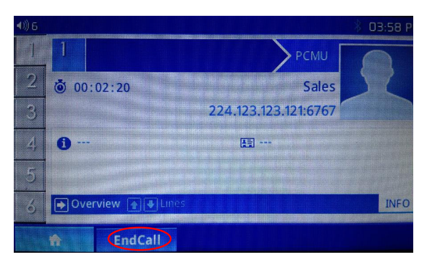
Figure 3 The Multicast Page Screen